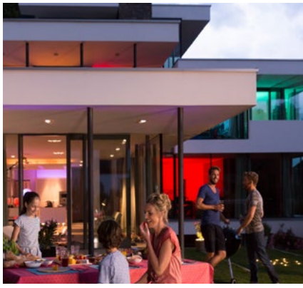
Residential Indoor Lighting