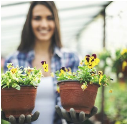
Consumer Horticulture Lighting